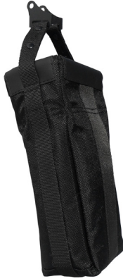
CTCM21 - CTCM22 for Prostar