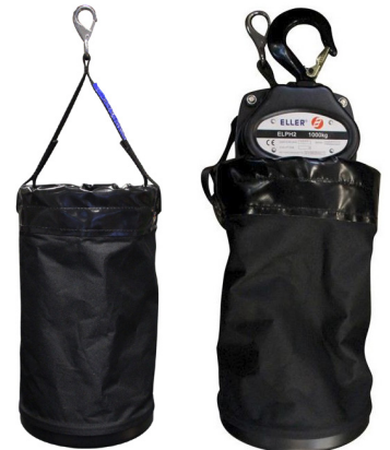
* Hoist included

Chain bags with hook for the ELLER hand chain hoists.