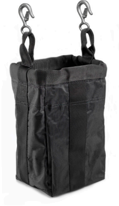
CTRSCBL010 - CTRSCBL015 for Lodestar