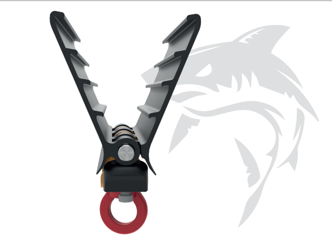
Design registered in the EU and UK