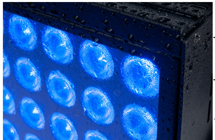
IPX4 Outdoor Rated

Specifications are subject to change without notice ©Elation Professional 08/12/20