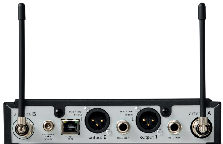
SLXD4D+ Back Panel