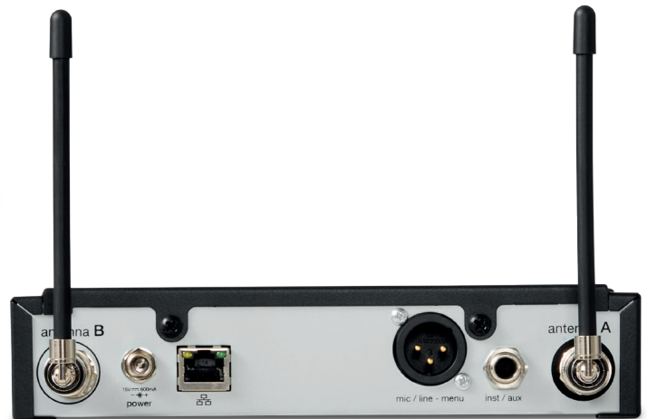
SLXD4+ Back Panel