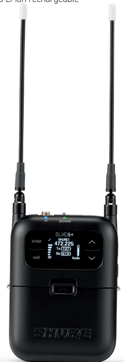
SLXD5+ Single-Channel Portable Digital Wireless Receiver