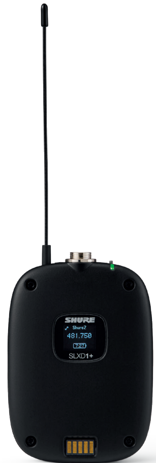
SLXD1+ Digital Wireless Bodypack Transmitter