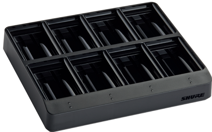
SBC80-903 8-Bay Battery Charger

Recharging station for up to eight (8) SB903 rechargeable lithium ion batteries. The charging cradle is designed to fit in a rackmount drawer and provides a full charge for installed batteries in 3 hours. LED indicators illuminate to indicate battery health and charging status.