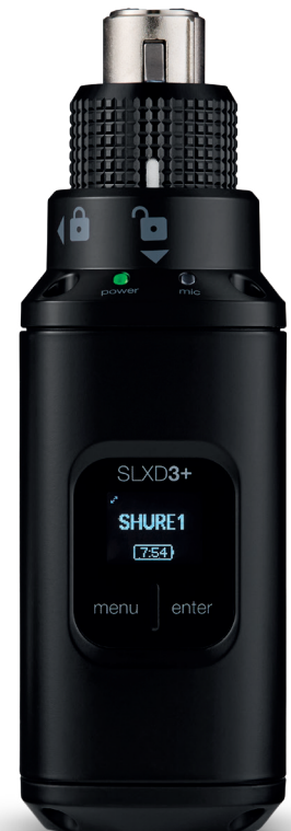
SLXD3+ Digital Wireless Plug-On Transmitter