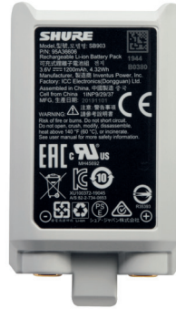
SB903 Rechargeable Lithium Ion Battery