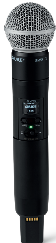
SLXD2+/58 Digital Wireless Handheld Transmitter