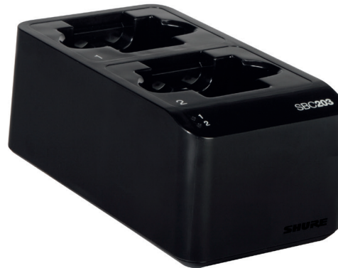
SBC203 Dual-Docking Recharging Station

Dual docking recharging station charges two SB903 lithium-ion batteries in or out of their transmitters. Built to charge two batteries, two body pack transmitters, two handheld transmitters or any pairing of two SLX-D transmitters or SB903 batteries.