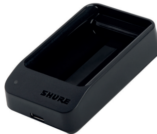
SBC10-903 Single Battery Charging Sled